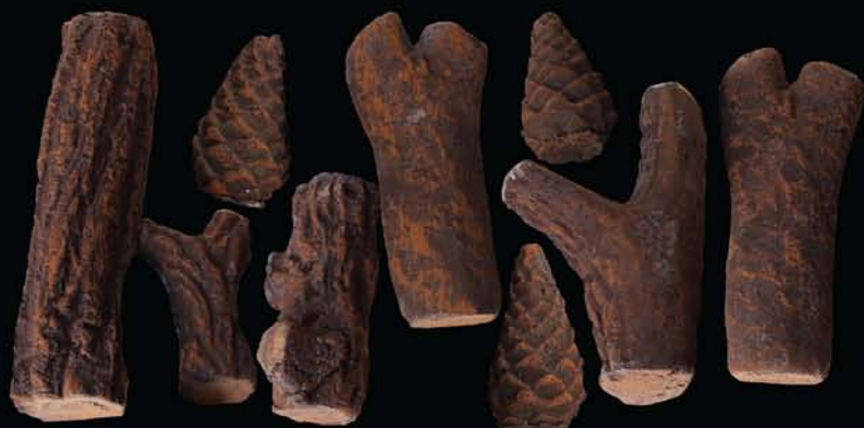
9 Piece Ceramic Log Set