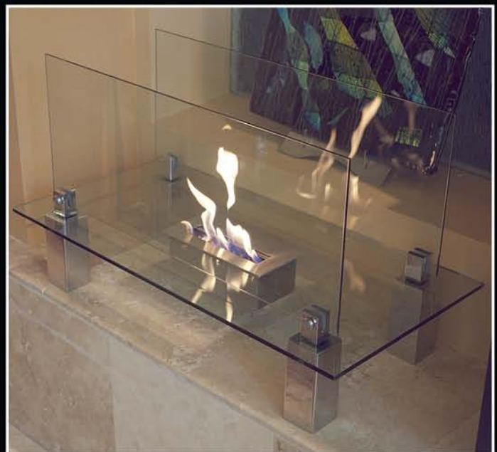
FIERO Freestanding Floor 17.71" h x 31.49" w x 15.74" d Model Number: NF-F3FIO