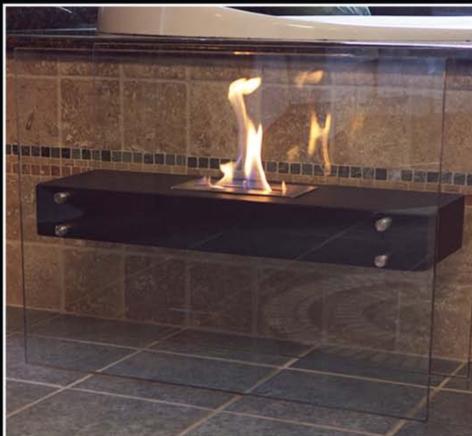
LA STRADA Freestanding Floor 23.62" h x 31.49" w x 11.81" d Model Number: NF-F3LAA