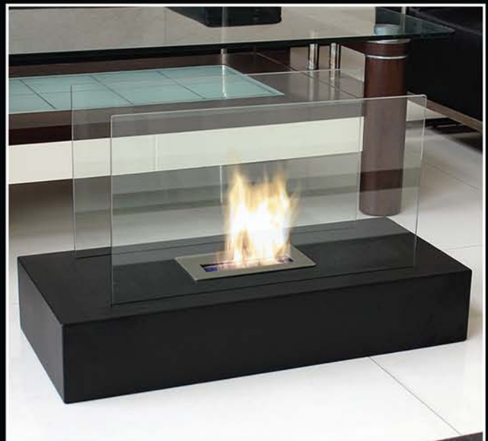
FIAMME Freestanding Floor 18.50" h x 31.49" w x 13.78" d Model Number: NF-F3FIE