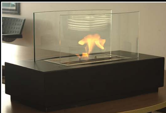
TIZZO Freestanding Floor 16.14" h x 23.62" w x 11.02" d Model Number: NF-F2TIO