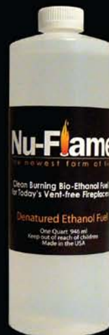
Nu-Flame Premium Ethanol Fuel Available in a 6 pack or 12 pack